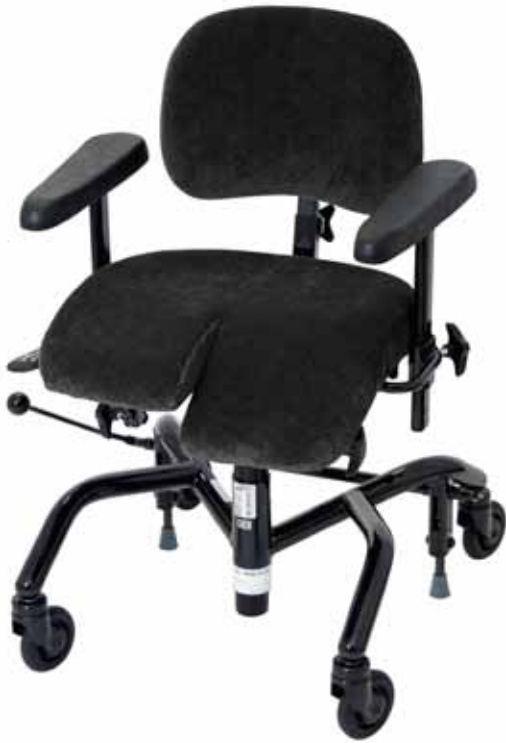
REAL 9700 PLUS COXIT