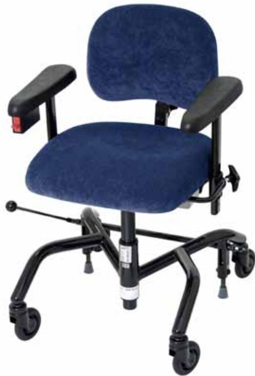
REAL 9100 PLUS EL