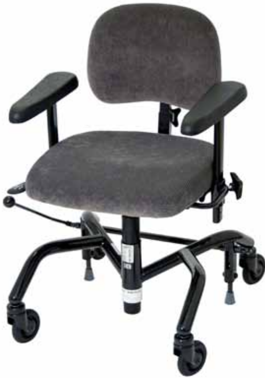
REAL 9000 PLUS