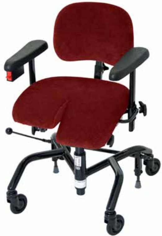
REAL 9800 PLUS COXIT EL